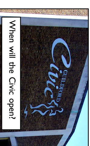
When will the Civic open?

Consultants' plans for development of flats and parking alongside the Civic would not be compatible with refurbishment.