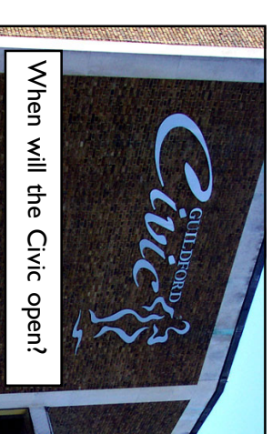
When will the Civic open?

Consultants' plans for development of flats and parking alongside the Civic would not be compatible with refurbishment.