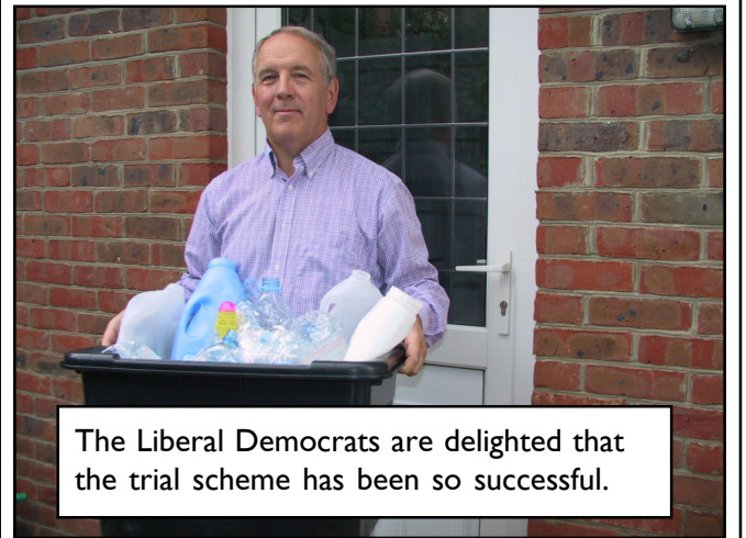
The Liberal Democrats are delighted that the trial scheme has been so successful.

Residents should call the Waverley recycling team on 01252 717614 if they have specific concerns or special circumstances that need to be addressed.