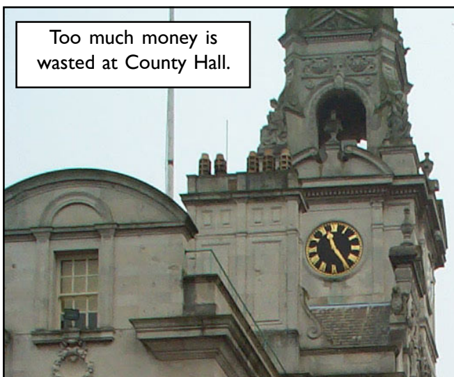
Too much money is wasted at County Hall.

"Having wasted this money the Tories have had to find cuts of £50 million to get them out of their financial black hole. It is appalling that Surrey's thrown money away which could have been spent on better services for local people."