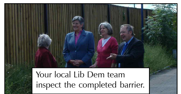
Your local Lib Dem team inspect the completed barrier.

"It makes such a difference to those living by the road, protecting them from noise, dust and fumes. Many thanks to the contractors who tried to keep disruption to a minimum while the work was being done."