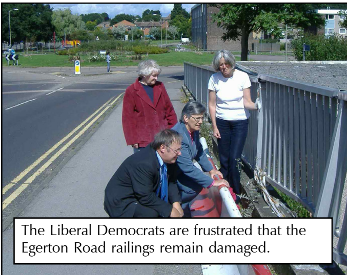
The Liberal Democrats are frustrated that the Egerton Road railings remain damaged.

Once again residents have been let down by the County Council's highways contractors.