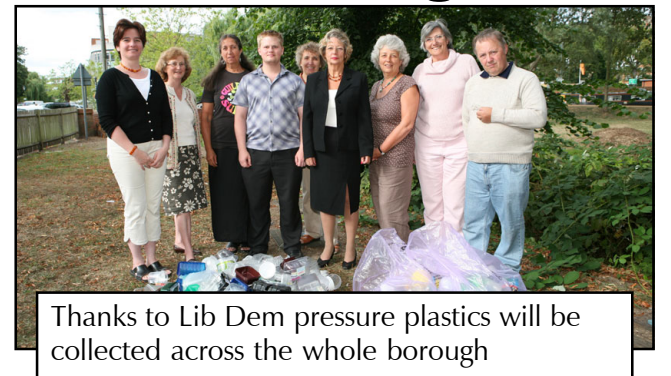
Thanks to Lib Dem pressure plastics will be collected across the whole borough

Guildford will finally benefit from Borough-wide kerbside collection of plastic bottles, after the Conservatives backed down.