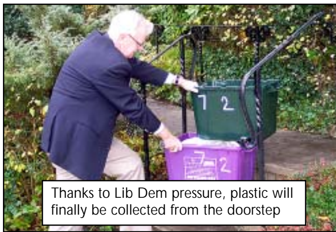
Thanks to Lib Dem pressure, plastic will finally be collected from the doorstep

Guildford will finally benefit from Borough-wide kerbside collection of plastic bottles, after the Conservatives backed down.